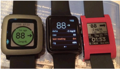
Figure 2: Three different smartwatches running Nightscout [14]