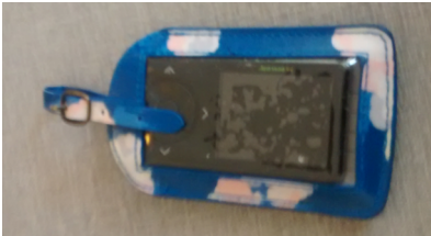
Figure 1: Luggage tag used to carry a CGM