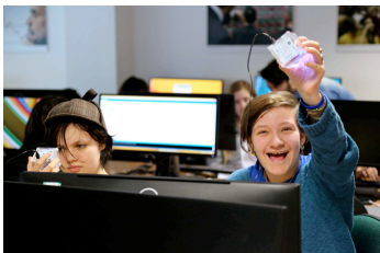
Figure 2: Children showcase their Internet of Things creations at a ConnectUs workshop

Permission to make digital or hard copies of part or all of this work for personal or classroom use is granted without fee provided that copies are not made or distributed for profit or commercial advantage and that copies bear this notice and the full citation on the first page. Copyrights for third-party components of this work must be honored. For all other uses, contact the Owner/Author. Copyright is held by the owner/author(s). UbiComp/ISWC'16 Adjunct , September 12-16, 2016 Heidelberg, Germany ACM 978-1-4503-4462-3/16/09. http://dx.doi.org/10.1145/2968219.2971435